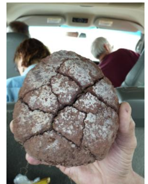
A breadcrust bomb!!!

Be sure to join us in 2012! The annual meeting is a great way to get energized and ready to bring new ideas into your teaching!