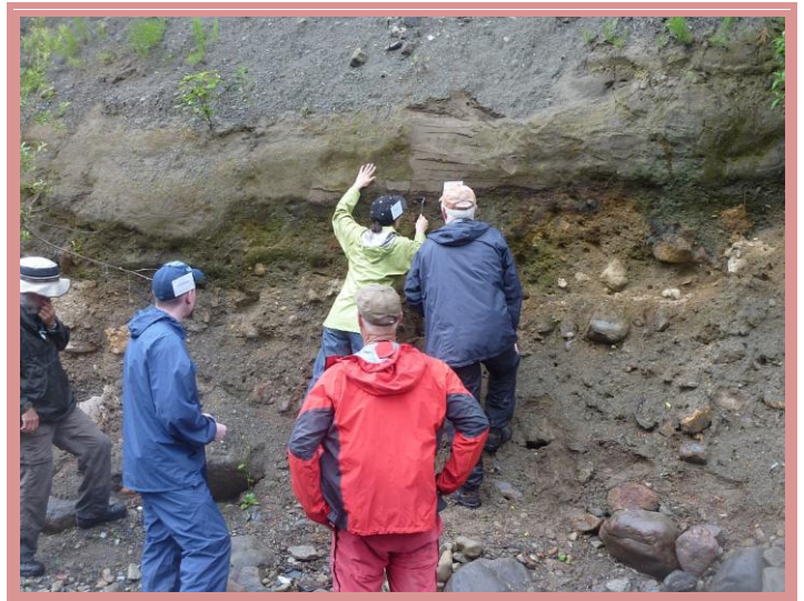
Examining Middle Fork lahar sediments on the July field trip.

A descent into the twin craters visited the unusual ponds on the crater floor. The trip ended by examining road cuts in tephra and lava of the Schreibers eruption to learn about lava behavior and features such as stretched vesicles, basal breccia, and phenocrysts, as well as learning the difference between 'scoria' and 'pumice', 'lapilli' and 'ash'.