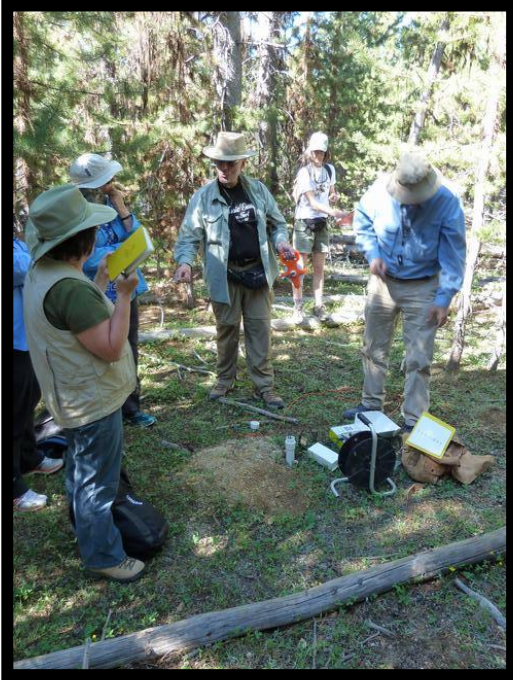
Day 1 involves taking groundwater measurements near Jack Creek and several other fen sites. The groundwater lies in a shallow pumice layer deposited during eruptions of Mt. Mazama.

Special thanks go to Mike Cummings, Portland State University for organizing this 4 day event that included 3 and ½ days in the field in beautiful Southeastern Oregon. Participants got to explore the fens created by the eruption of Mt. Mazama on the eastern side of the Cascades all the way to Steens Mountain and the Alvord Desert in the very eastern part of the state. Here are some of the memories in pictures.