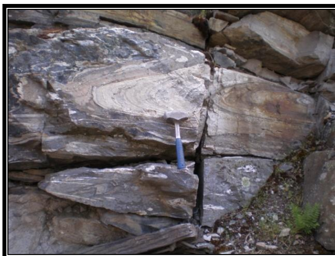
Fig. 3 Mind-boggling Metamorphics: Sheath folding in amphibolites of the Kettle Complex!

This promises to be an exciting conference! We hope to see you next June.