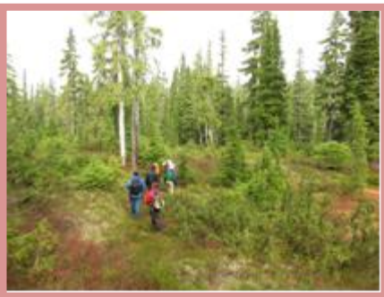
An intrepid group heads across Schreibers Meadow toward the cinder cone.

In an innovative approach to the dual purpose of education and fundraising, MBVRC sponsored four fund-raising geology field trips in 2011. Participants in the sold-out excursions included school teachers, professional geologists and hazard managers, university professors and students. The majority of participants were members of the general public who have an interest in geology in general and their backyard volcano in particular, but who have little to no formal education in these subjects. People came from Yakima to Victoria and everywhere in between, and ranged in age from 15 to well beyond retirement. MBVRC provides a trip leader, van transportation, and written field trip guides written for the intended audience. Trips invariably sell out.