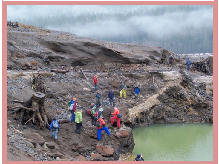
Winter drawdown of the Baker Lake Reservoir provides the only opportunity to investigate a lava flow that invaded lake sediments 9500 years ago.