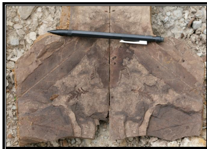
Fig. 2 Incredible Imprints: Miocene fossils of the Clarkia!

Here's a sneak-peek at the beauty of Eastern Washington and Idaho and the wonders you will encounter: